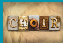
Adult Vocal & Bells!