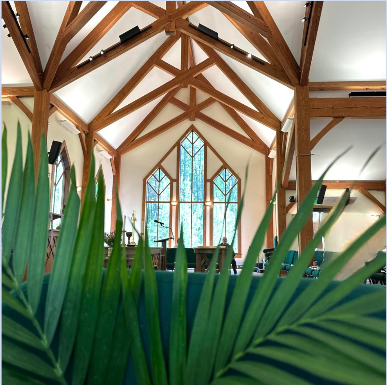
Palm Sunday