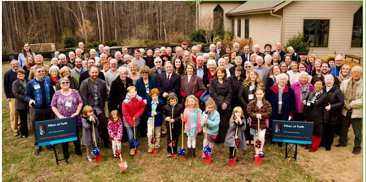
December 2016 Fellowship Hall Groundbreaking