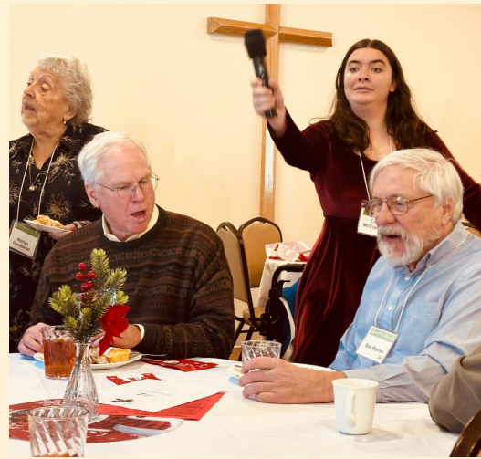
with parental permission to publish.