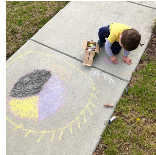
Sidewalk Art - Oliver Bejcek