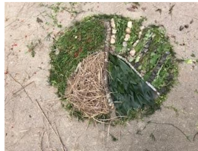
Natural Art - Finn Yale.